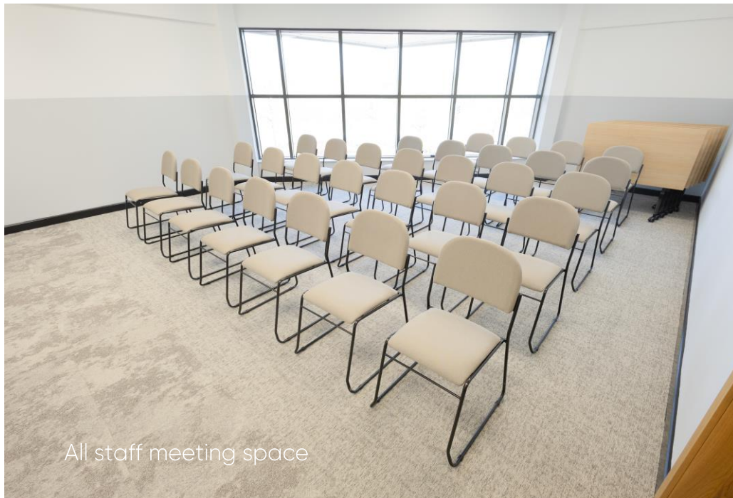
All staff meeting space