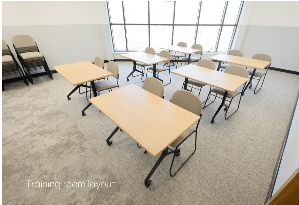
Training room layout