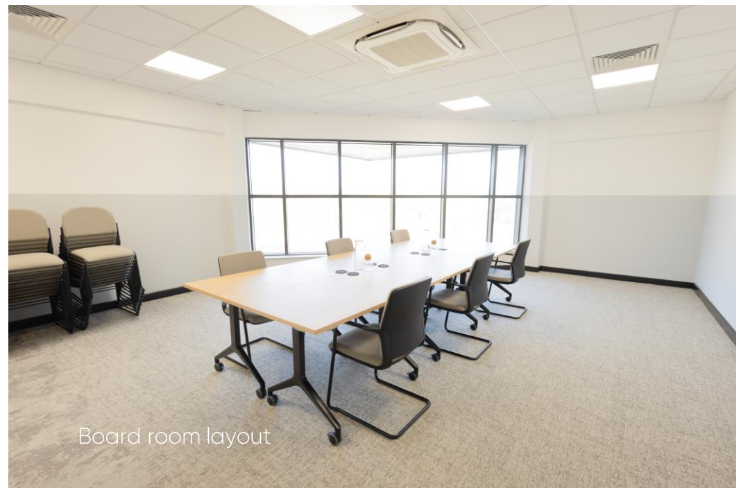
Board room layout